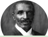
George Washington Carver

Green Economy and Urban Revitalization Strategist - Bronx, NY